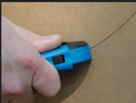
3 Button design for convenient tray cuts