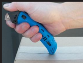
Blade-less tape splitting eliminates cut injuries