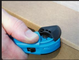
Auto retractable safety hood for safe top cuts