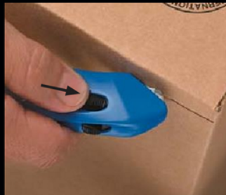
Push Release Button forward allowing guard to retract and expose the blade.