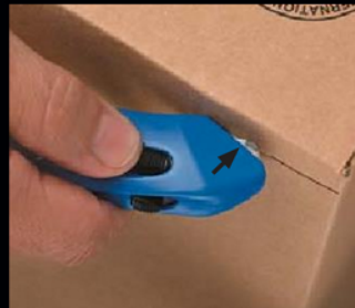
Press blade firmly into cutting surface to start the cut. Place opposite hand out of the path of a cut line.