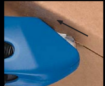
Continue your cut, letting friction of box maintain blade exposure. Blade guard will automatically relock at the end of the cut.