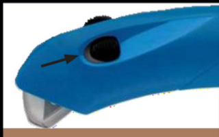
In Locked Position the blade is covered