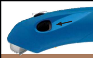
Push Release Button forward allowing guard to retract and expose the blade