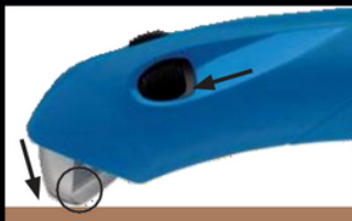
After the cut the blade guard relocks automatically, preventing slip off cuts, even while button is engaged.