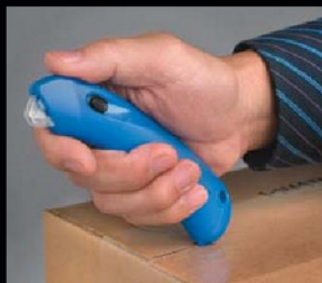
Blade-less Tape Splitting eliminates all cut injuries.